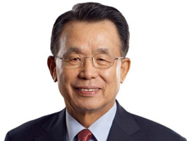
Dr Han Seung-soo, KBE Non-executive Director Resolution 11