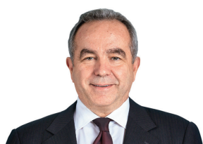
Dr Kurt Campbell Non-executive Director Resolution 5