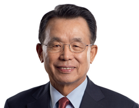
Dr Han Seung-soo, KBE Non-executive Director Resolution 10