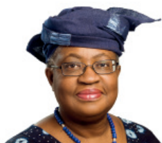
Dr Ngozi Okonjo-Iweala