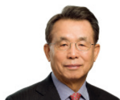
Dr Han Seung-soo, KBE