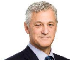
Bill Winters, CBE Group Chief Executive Resolution 16