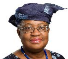
Dr Ngozi Okonjo-Iweala Non-executive Director Resolution 4