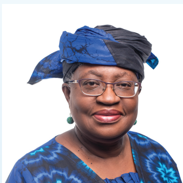
Ngozi Okonjo-Iweala Independent non-executive director