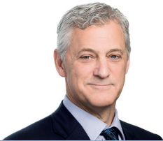
Bill Winters, CBE Group Chief Executive

Appointed: June 2015. Bill is a director of Standard Chartered Bank and Standard Chartered Holdings Limited.