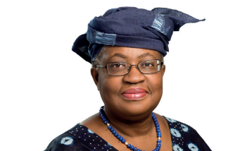
Dr Ngozi Okonjo-Iweala Non-executive Director